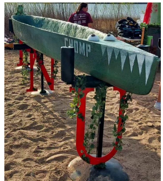
UNL Concrete Canoe