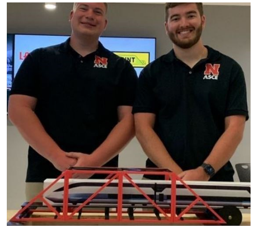
UNL 3D Printed Bridge