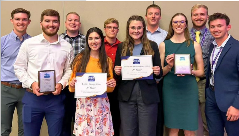
UNL & UNO Students with Awards