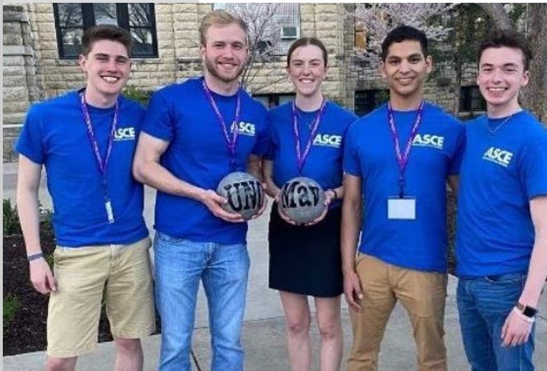
UNO Concrete Bowling Team