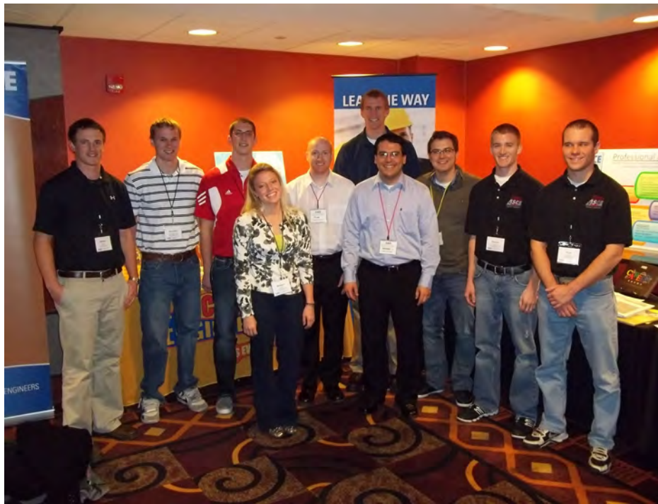
NEASCE Members and Student Members at the Multi Region Leadership Conference

This Leadership Conference was a wonderful opportunity to gain a better understanding of ASCE, to become familiar with the present and future of the Society, and to discover ways to get more involved with ASCE. The conference also provided attendees the opportunity to meet other members, share ideas and reconnect with old friends.