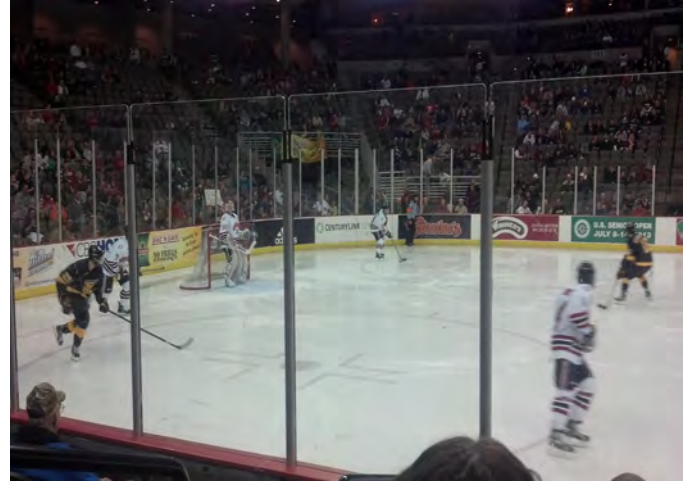
Younger Member Group UNO Hockey Game Outing