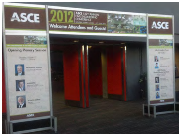
ASCE 142nd Annual Civil Engineering Conference