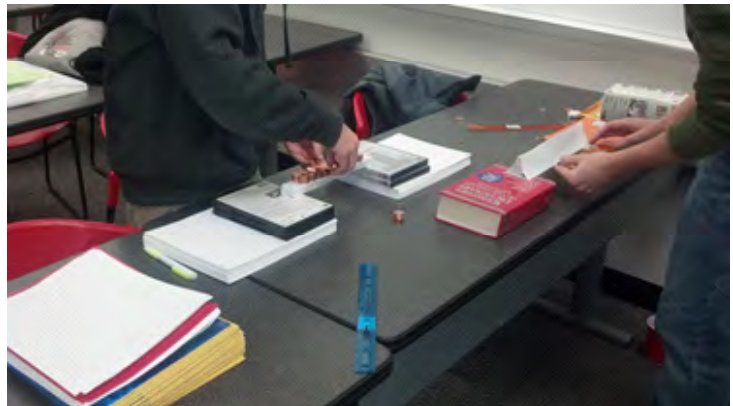
Bridge building activity at the PKI open house