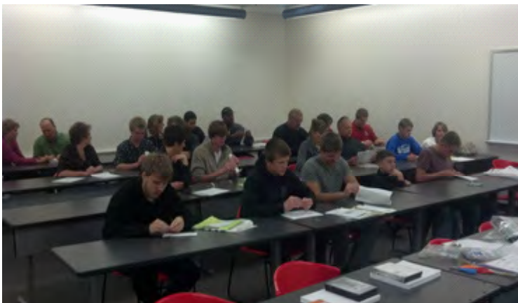
PKI Open House