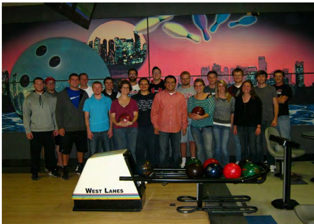
2012 Bowling Event with UNO Student Chapter and Younger Member Group

On October 4th, the Younger Members Group (YMG) joined efforts with the UNO Student Chapter to host a bowling event at West Lanes in Omaha. In total, 16 students and 3 younger members participated in this fun and social event. The YMG would like to thank the UNO Student Chapter for allowing us to participate in this fun activity. The Younger Members Group will be having its Annual Toy Drive in Friday, December 14th. Additional information and details will be sent in the near future. Save the date and hope you can join us in this event.