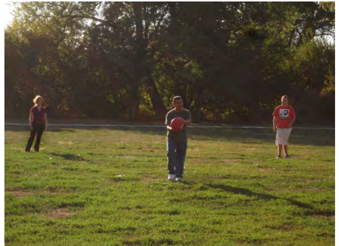
Photos from the 2012 Younger Member Group Kickball Game