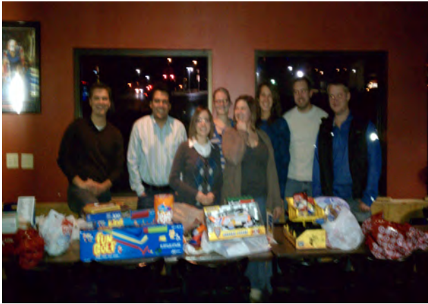
Younger Member Group Toy Drive