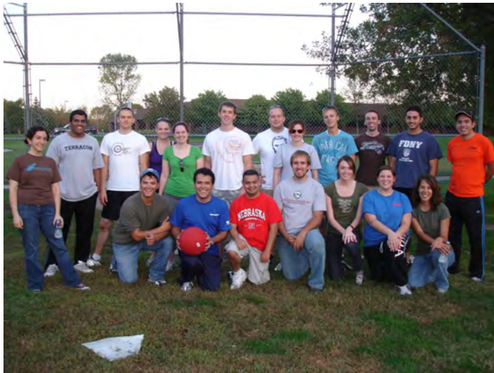
Younger Member Group Kickball Game